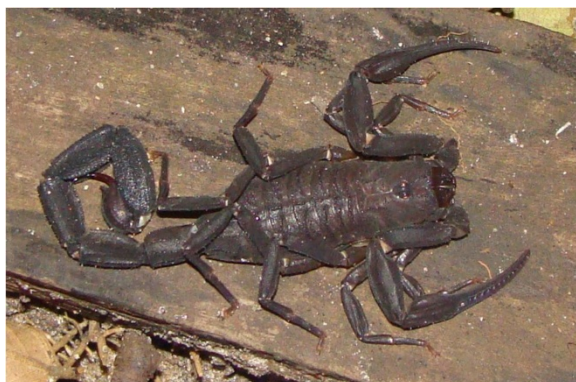
Figure 2 Female specimen of Tityus obscurus (Gervais, 1843) with length of 10 cm from the eastern region of Pará state, Brazil. It had been provided by a patient who was showing systemic manifestations upon hospital admission.

Most of the patients with confirmed envenomations were living in the eastern portion of Pará state ( n = 34, 71%), which presented an equal distribution of males and females whereas in the west males predominated. The ages of patients were similar in both areas with a median of 31.5 (23-41) years in the east, and 31.5 (20-50) years in the west, but the accidents happened mainly to patients older than 15 in both areas. The stings