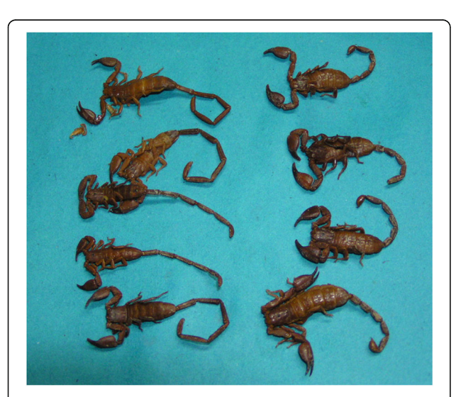
Fig. 3 A photographic illustration of males (on the left) and females (on the right) specimens of Hemiscorpius lepturus . Note the very short stinger size and longer tail in males

Hemiscurpius are non-digger scorpions usually the length of females and males reaches to 5 and 8 cm, respectively (males have a longer tail). Therefore, they present sexual dimorphism and their body color is transparent to turbid yellow. The pedipalps and legs are lighter in color, while moveable and fixed fingers of pedipalps are reddish brown. Brown spots can be observed at the end of the