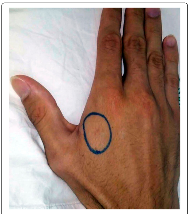
Fig. 3 Snakebite site on the right hand

The two steps of serum therapy were diluted in 0.9% NaCl saline solution and infused intravenously in 40 min without any adverse reactions. The patient was then admitted at the intensive care unit for 1 day for close cardiovascular and respiratory monitoring, and