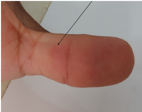
Figure 2 Scorpion sting site on the middle of the thumb 56 hours after the accident.

the Amazon forest in Pará state, which, based on the symptoms, was classified as mild or Class I. However, it is known that symptoms provoked by envenomations depend on several factors such as the dose of venom injected, site of the sting, age, body mass and physiological conditions of the victim, being children and elderly the most vulnerable [5,6,9,16,17]. In conclusion, this report contributes to the knowledge on scorpion species capable of causing envenomations in Brazil. However, further study is required in order to evaluate the toxicity of this species on humans, which will make possible the classification of R. amazonicus as a scorpion of medical importance in the country.